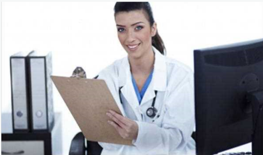
HemorrhoidsNatural Remedy HemorrhoidsBowelHemorrhoid

Venapro makes use of only 100 % natural ingredients. These include herbs and minerals which usually work by initiating a response from the immune system. This then reduces the pain that is associated with hemorrhoids. The Venapro Ingredients are a couple of the most effective hemorrhoid treatments currently available.