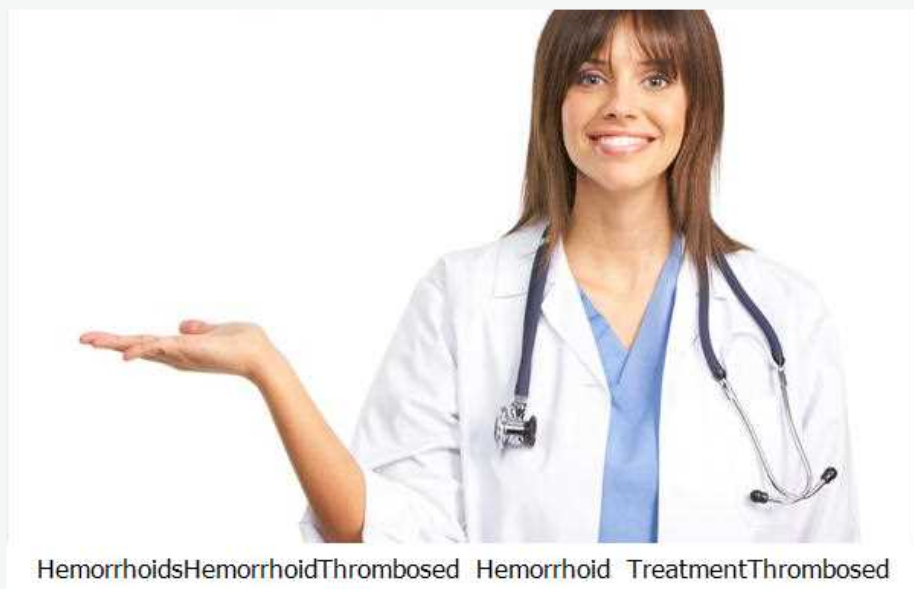
HemorrhoidsHemorrhoidThrombosed Hemorrhoid TreatmentThrombosed