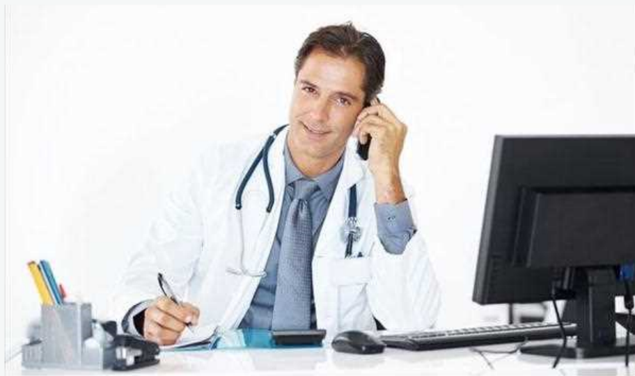
HemorrhoidsHemorrhoidPilesInternal PilesExternal HemorrhoidExternal

This condition is a result of poor food habits, old age, heredity factors, as well as pregnancy, besides quite a few other factors. As it is, all the remedies and treatment, which are used for the treatment of normal hemorrhoid, can be used for the treatment of prolapsed hemorrhoids. These kinds of therapies usually revolve around natural procedures, such as increasing the intake of high fiber foods, increasing the consumption of fluids, staying away from addiction to alcohol, tobacco or smoking, as well as proper exercise. Apart from these types of, warm water bath, applying ice packs on the affected area as well as using creams and ointments on the affected area, are other remedies with regard to this condition.