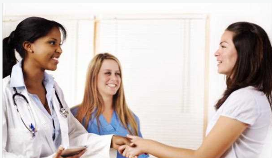
HemorrhoidsHemorrhoid TreatmentHemorrhoidNatural Hemorrhoid