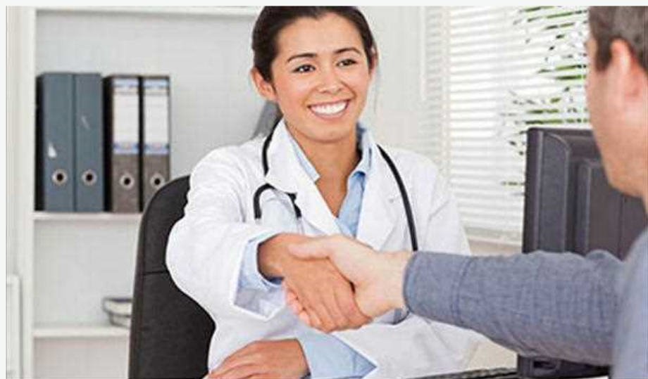
HemorrhoidsExternal HemorrhoidsCure External HemorrhoidsHemorrhoid